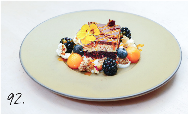
91. Yuzu Cake 7,50

Yuzu Cake | Blackberries | Blue berries Cantaloupe Melon | Yogurt | Popcorn | Passionfruit sauce