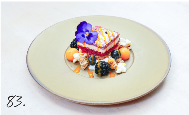
83. Raspberry Cake 7,50

Vegan chocolate cake | Nuts | Blackberries | Blue berries Cantaloupe melon | Yogurt | Popcorn | Passionfruit sauce