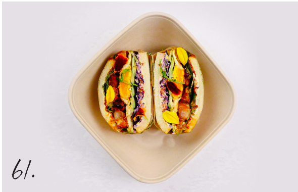
61. Sweet Tori Sando 11,-

Chicken thigh fillet | Fried egg | Cucumber | Chili sauce Yakitori sauce | Gem of lettuce | Red cabbage | Cream cheese | Tomato pesto