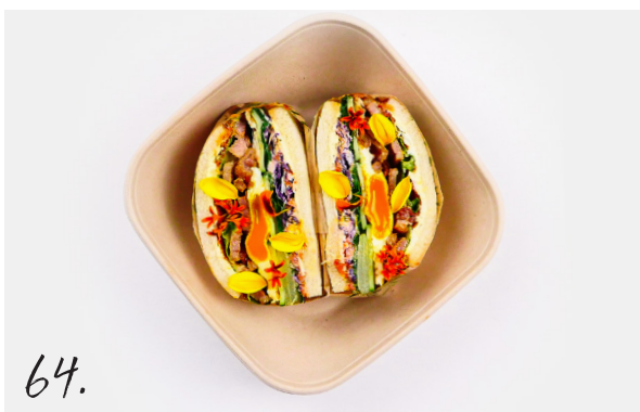
64. Piggy in the Sando 11,-

Beef | Cream cheese | Cucumber | Tomato Little gem lettuce | Sesame | Red cabbage