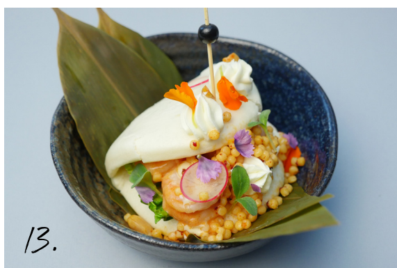
13. These Shrimps are Made for Eating 8,- Shrimp Bao Bun

Steamed bun | Tenderloin | Black Bean sauce | Cream cheese