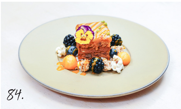
84. Caramel Mocha Cake 7,50

Raspberry cake | Nuts | Blackberries | Blue berries Cantaloupe Melon | Yogurt | Popcorn | Passionfruit sauce