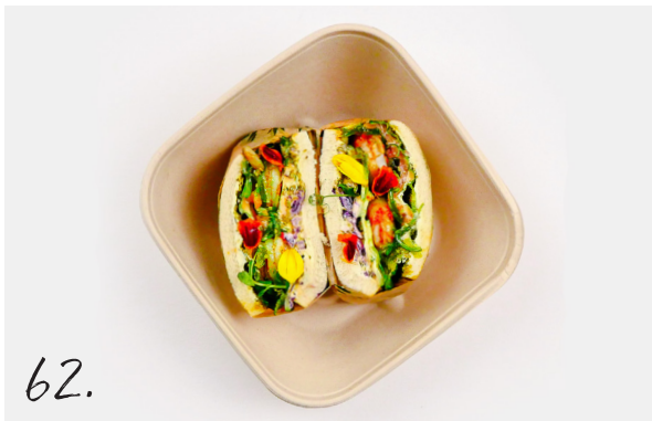
62. Creamy Smokey Salmon Sando 11,-

Chicken thigh fillet | Fried egg | Cucumber | Chili sauce Yakitori sauce | Gem of lettuce | Red cabbage | Cream cheese | Tomato pesto