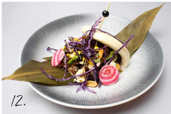
12. Beef Me Up! 8,- Black Bean Beef Bao Bun

Steamed bun | Tenderloin | Black Bean sauce | Cream cheese