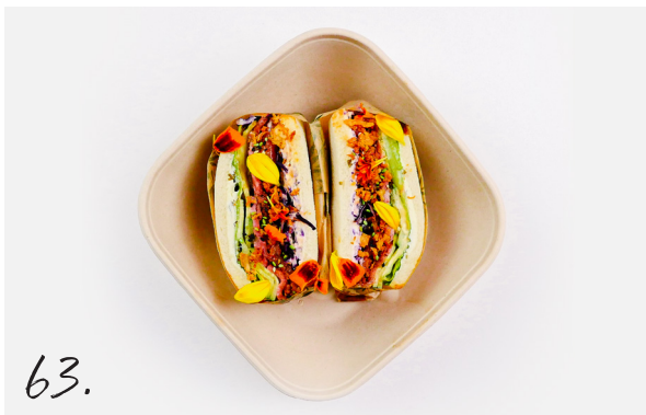
63. Done Veggie, back to Meaty Sando 11,-

Smoked salmon | Gambas | Cucumber | Wakame | Chili mayonnaise | Cream cheese | Basil pesto | Red cabbage