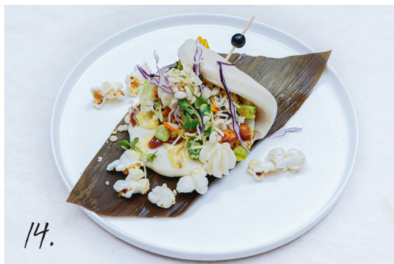
14. Issa Gem ♡ 8,- Veggie Bao Bun

Steamed bun | Prawn | Chilli mayonnaise | Cream Cheese